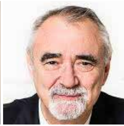
Dr. Percy Barnevik CEO, Chairman, Board Member of ABB, General Motors, DuPont, Astra