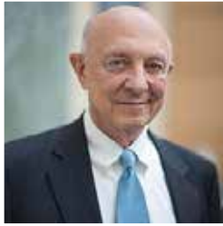
Ambassador Jim Woolsey Former Director, CIA