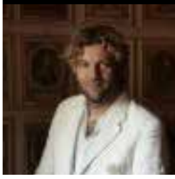
Prince Lorenzo de' Medici