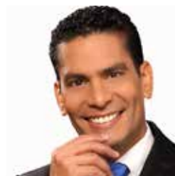
Mr. Ismael Cala CNN Espanol