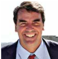
Mr. Tim Draper Founder Draper Ventures