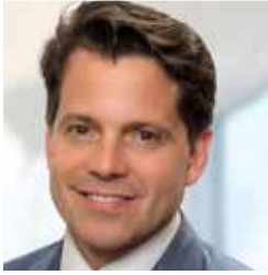
Mr. Anthony Scaramucci Founder SkyBridge Capital