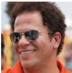
Mr. Romero Britto International Artist