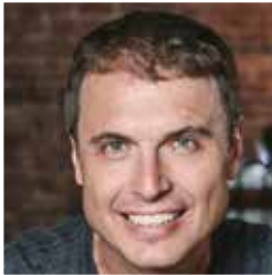
Mr. Kimbal Musk Co-Founder The Kitchen Community

DC Finance is known for its high caliber events, with a host of speakers coming from technology, real-estate, media, film, arts, philanthropy, luxury, finance, business and private equity management.