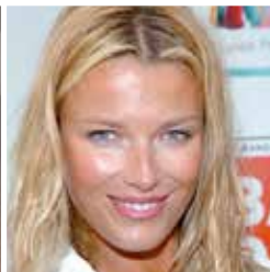
Ms. Veronica Varekova Goodwill Ambassador, African Wildlife Foundation