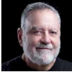
Mr. Morton H. Meyerson Chair 2M Companies