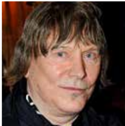
Mr. James Rado Co-Author Hair