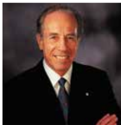
Mr. Isadore Sharp Founder & Chairman Four Seasons Hotels and Resorts