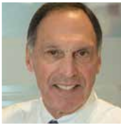
Mr. Dick Fuld Former Chair & CEO, Lehman Brothers, and Founder & CEO, Matrix Private Capital Group