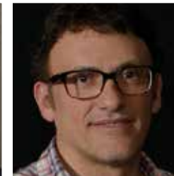
Mr. Anthony Russo Director of The Avengers & Captain America