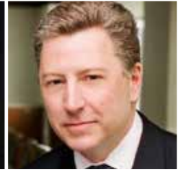
Ambassador Kurt Volker Former US Permanent Representative to NATO