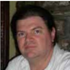
Mr. Yann Lecun Head of Artificial Intelligence, Facebook