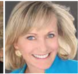
Ms. Kay Koplovitz Founder USA Networks