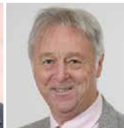
Mr. David Lloyd Tennis Legend & Entrepreneur