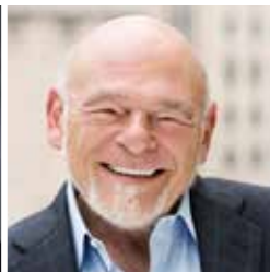
Mr. Sam Zell Chairman, Equity Group Investments